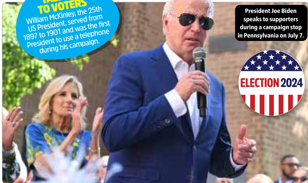
President Joe Biden speaks to supporters during a campaign stop in Pennsylvania on July 7.

William McKinley, the 25th US President, served from 1897 to 1901 and was the first President to use a telephone during his campaign.