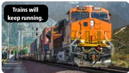
Trains will keep running.

Democrats in the House of Representatives made history when they elected their leaders for the next session of Congress. Hakeem Jeffries of New York will be the first Black person to serve as minority leader. Peter Aguilar of California will be the party caucus chairman, becoming the top-ranking Latino in House history. Katherine Clark of Massachusetts was elected as whip. Republicans are expected to elect their House leaders in January.