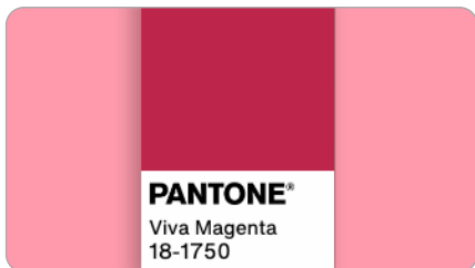
PANTONE® Viva Magenta 18-1750

Trains will continue to deliver goods across the US after a law was passed that made it illegal for railway workers to strike (walk off a job). A railway strike during the holiday season could have cost the US economy $2 billion per day, experts said. Under the new law, workers will have their pay increased over the next five years but will not receive paid sick days, which they had advocated for.