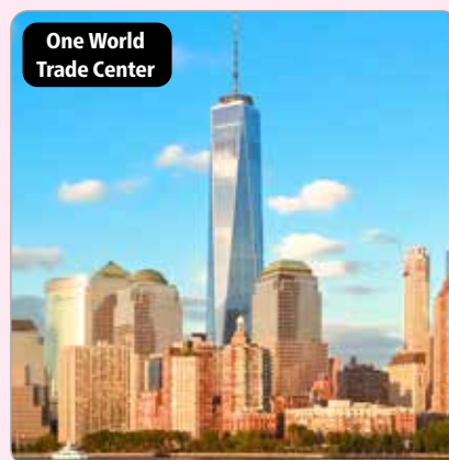
One World Trade Center

One World Trade Center opens On November 3, 2014, One World Trade Center officially opened in New York City. The skyscraper was built after the Twin Towers of the World Trade Center were destroyed in the terrorist attacks of September 11, 2001. Nicknamed the Freedom Tower, the building stands 1,776 feet tall, a height chosen to mark the year 1776, when the US gained its independence.